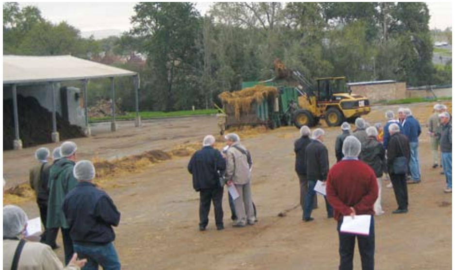
Conference delegates view a composting facility at Stellenbosch, near Cape Town

Growers saw first hand the difficulty in dealing with aggressive trichoderma and now better understand the measures that need to be taken to manage the disease. The South African experience with this disease also rammed home the importance of some of the work currently being done in the international research community on early detection of disease.