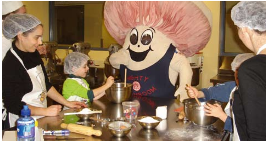
Mighty Mushroom at the Kids in the Kitchen program at Regency TAFE, Adelaide

Foodservice: The Mushroom Mania foodservice promotion held during June 2006 was a great success with 1044 restaurants participating nationally.