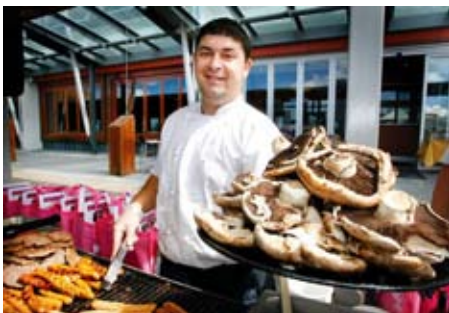
BBQ Mushroom Promotion