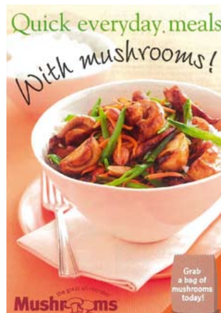
Mushroom recipe leaflet

The level of evaluation undertaken by the industry through longitudinal market research ( Mushroom Monitor ) and post-activity analysis is highly comprehensive and provides a strong grounding upon which to make informed decisions. This aspect is often the weak link in planning exercises in many organisations.